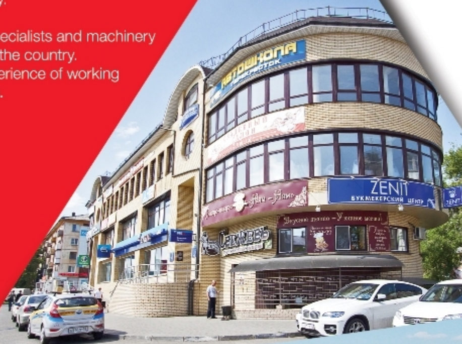
Lenta hypermarket, Tyumen, 12500 m 2 General contractor, General planner, Technical client Works finished 1.5 months ahead of schedule