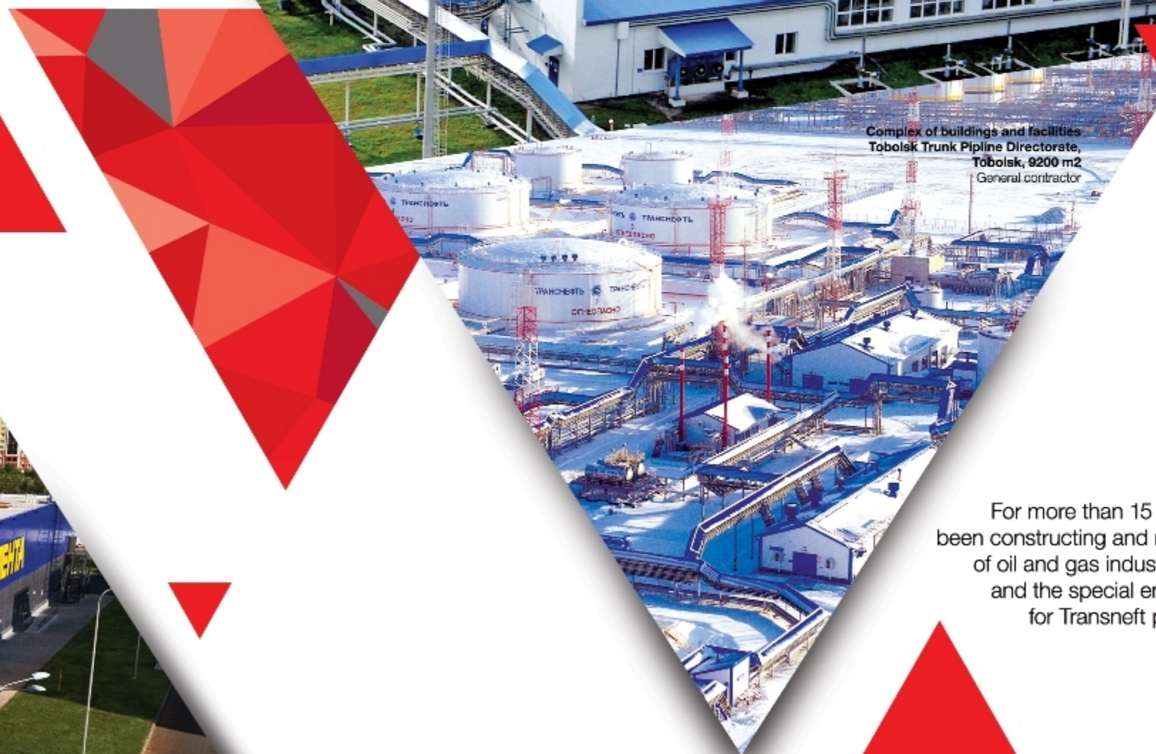
Complex of buildings and facilities Tobolsk Trunk Pipeline Directorate, Tobolsk, 9200 m 2 General contractor

For more than 15 years ANA Group has been constructing and reconstructing objects of oil and gas industry, including buildings and the special engineering installations for Transneft public stock company.