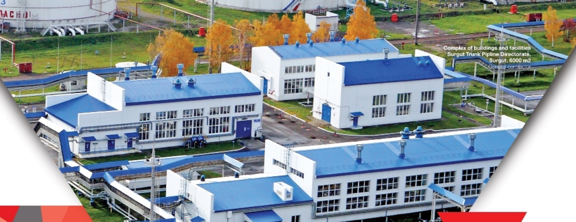
Complex of buildings and facilities Surgut Trunk Pipeline Directorate, Surgut, 6000 m 2 General contractor