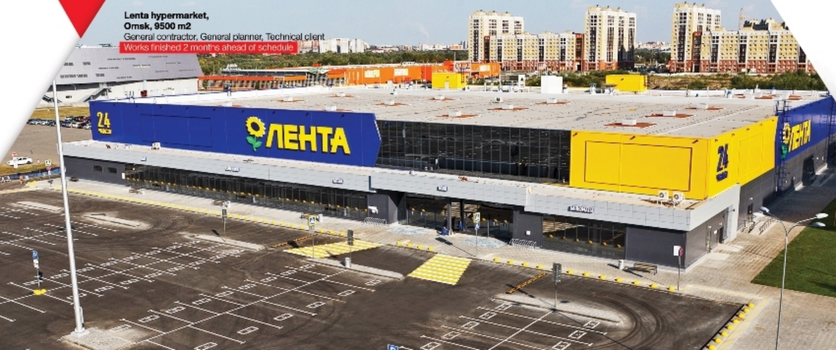
Lenta hypermarket, Omsk, 9500 m 2 General contractor, General planner, Technical client Works finished 2 months ahead of schedule